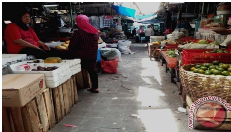
Picture 3. Minang-Chinese Interaction at Tanah Kongsu Market in Padang City