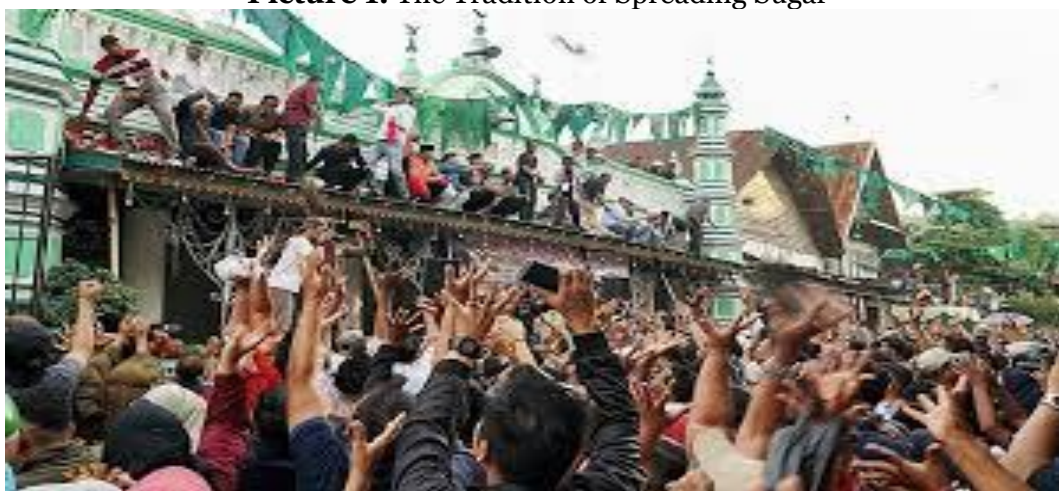
Picture 1. The Tradition of Spreading Sugar

Sumber: https://www.kompas.id/baca/nusantara/2020/01/26/manisnya-berbagi-dalam-tradisi-serak-gulo-2, 2024