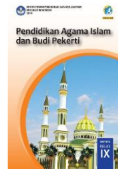
Figure 6 Students' Book PAI & BP Class 9 Curriculum 2013 Revision

have noble character towards their God, themselves and those around them. The goal of national education is to produce a generation of people who are charitable, pious, knowledgeable, competent, creative, healthy, independent, democratic, and responsible, not to produce religious experts. This goal is similar to the goal of the PAI subject, which is to produce a generation of Muslims who are religiously observant and have a noble character.