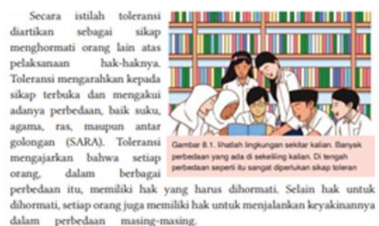
Figure 11 Tolerance coexists with other religions

Second, Tolerance education is also provided implicitly in every chapter of the PAI and Character Education textbooks. Students