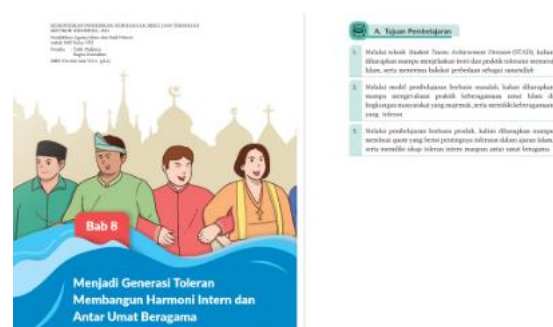
Figure 7 Explicit Tolerance Material

The above explanation regarding the material components of morality is in line with Ramayulis' opinion in his book that the scope of PAI includes human relationships with Allah, human relationships with fellow human beings, human relationships with himself, and human relationships with other creatures and the natural environment (Pawero 2017). Thus,