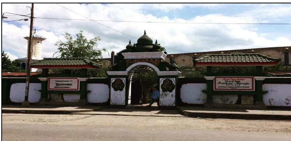
Figure 1 Mosque Raudhatul Muttaqin Kotaraja

Primary data sources are obtained based on the results of interviews and observations conducted by researchers to 25 respondents consisting of parties related to the Genealogical System of Imam Raudhatul Muttaqin Mosque Kotaraja East Lombok and Al-Bayani Mosque Gondang North Lombok, beginning with descendants of Shaykh H. L. Abdurrahman as mosque imams, village leaders, and the community (Table 1). This research is a type of case study with a qualitative model. The act of searching and collecting books, reputable national and international scientific journals, and documentation served as secondary data sources. The Genealogical System, Jurgan Habermas' communicative action theory, and the persuasive communication theory were the three primary theories utilized by the researcher. The researcher then applied the methods of data reduction, data display, and conclusion drawing and verification that Miles and Huberman recommended for qualitative data analysis (Thalib 2022).