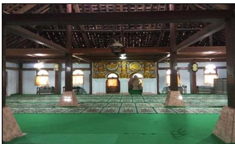
Figure 3 Inner Space of Raudhatul Muttaqin Kotaraja Mosque

The island of Lombok in West Nusa Tenggara, also known as the " Pulau Seribu Masjid ," is home to a number of distinctive features and undeniable historical facts. The title " Pulau Seribu Masjid " is not just a designation or label; rather, it has evolved into a sense of self-identity for the island (Hasanain and Muslimatusshalihah 2021). Of course, there are thousands, if not millions, of standing mosques, both small and large mosques (The Jami' Raudhatul Muttaqin mosque is a cultural icon and one of the famous mosques). The Jami' Raudhatul Muttaqin Mosque is in the interior of Kotaraja Village, a Sikur District Village in East Lombok. It is right at the intersection and opposite the village office, so finding it is simple (Observation, 2022). The mosque, which is the oldest mosque on the island of Lombok and is now a cultural heritage site and one of the historical tourist areas in the province of West Nusa Tenggara, is open to the public. Obviously, this mosque was not just